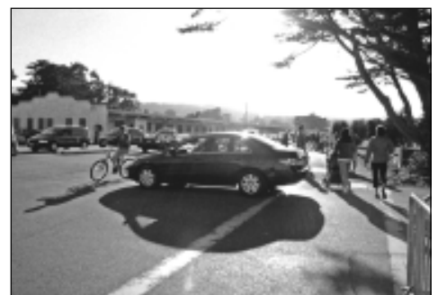
At Marina Blvd. and Lyon St., a poorly signed and marked intersection creates hazards for Bay Trail users which SFB wants to fix.