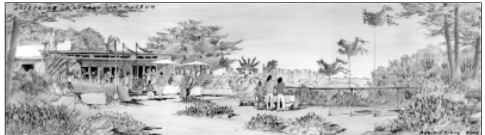
2005 Beautification Award winning site Randall Museum. For a recap of the Awards Dinner see pages 4 and 5.