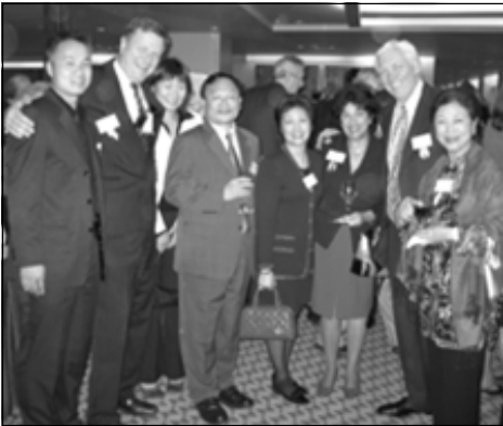
Board members and guests chat during the reception.

Beautification Award sites). Ron Wong and Associates coordinated the event. The success of the evening can be measured by the generosity of those who financially supported the event making possible even more great work by San Francisco Beautiful in 2006. We all say thank you.