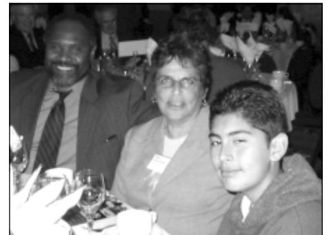
Beautification Award winners from Kid Power Park.