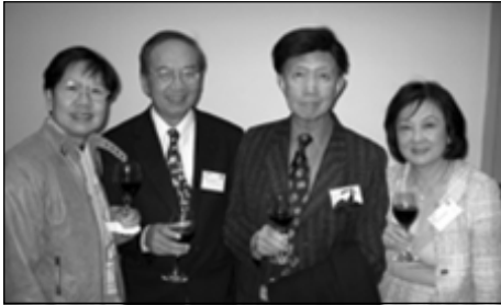
Far East National Bank guests at the reception.

Alana's Café American Conservatory Theater Amici's East Coast Pizzeria Aquarium of the Bay Asian Art Museum Bally Total Fitness The Basil Collection Bay Area Discovery Museum Bay Meadows Racecourse Berkeley Repertory Theatre