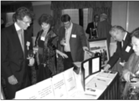
Browsing the silent auction tables.